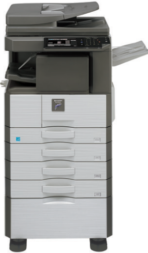
MX-M316N model shown.

NETWORK READY A3 BLACK & WHITE MFP WITH FLEXIBLE DESIGN